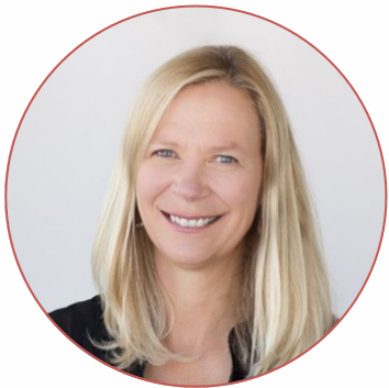
Linda Avey Co-Founder & CEO 23andMe