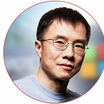
Qi Lu Former COO Baidu Inc.