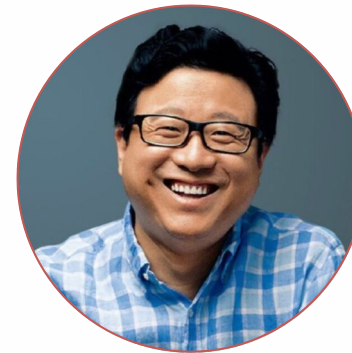
William Ding Chairman & CEO NetEase Inc.