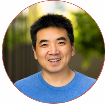
Eric S. Yuan Founder & CEO Zoom Video Communications, Inc.