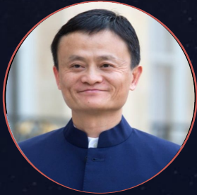
Jack Ma Co-founder and Former Executive Chairman of Alibaba Group

"Jerry Yang and I took a long walk during HYSTA's executive summit in Pebble Beach last year. Our discussions quickly accelerated when I returned to China and resulted in the landmark transaction between Yahoo and Alibaba."