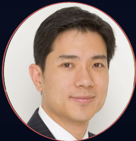
Robin Li Founder & Chairman Baidu Inc.

"HYSTA's executive summits provide business leaders with great opportunities to build valuable connections."