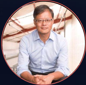
Jerry Yang Co-Founder & Former CEO Yahoo Inc.

"Jerry Yang and I took a long walk during HYSTA's executive summit in Pebble Beach last year. Our discussions quickly accelerated when I returned to China and resulted in the landmark transaction between Yahoo and Alibaba."